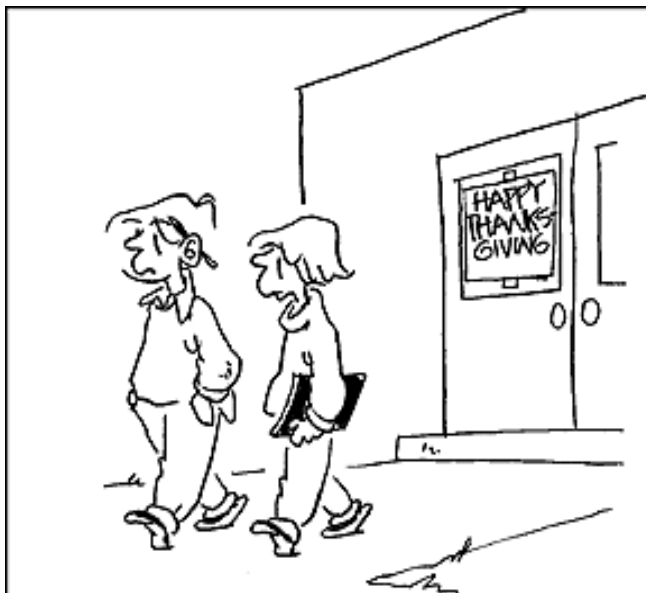
"I'm not going to count my blessings on Thanksgiving. I don't do math on holidays."

Circa 21 – Church Basement Ladies Show (date??)